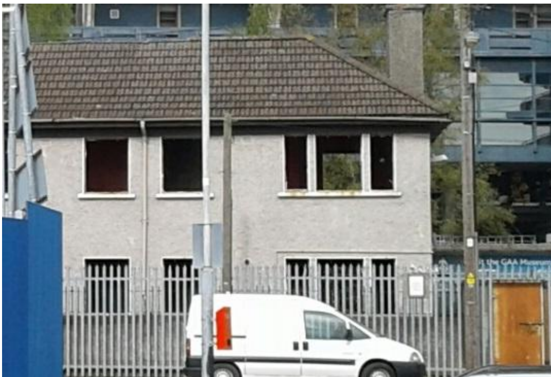
Demolition contractor now on site at Saint Andrews Court.