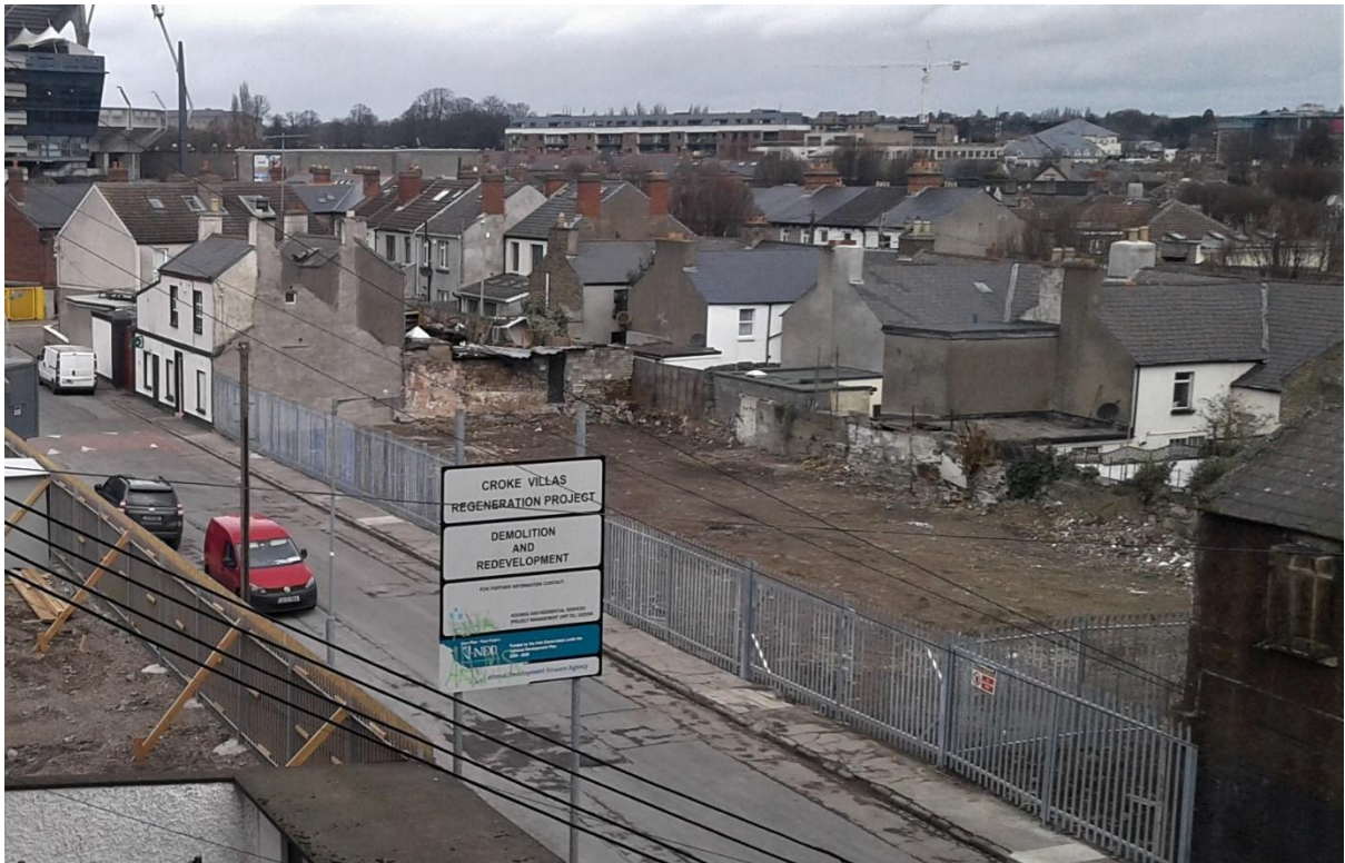
Demolition work on the former cottages on Sackville Avenue is now completed and the two sites cleared.